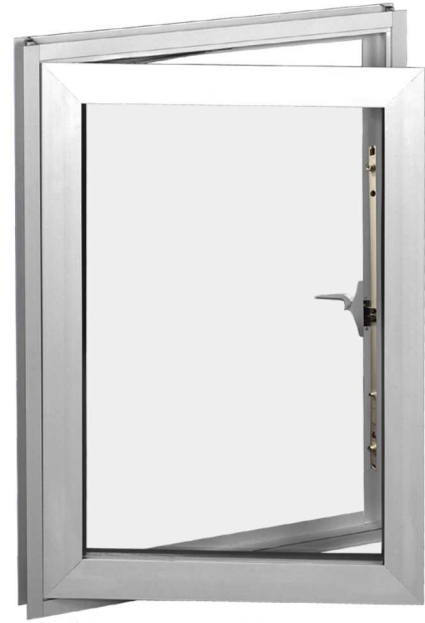
Series 8500 Aluminum Thermal-Break Casement Windows