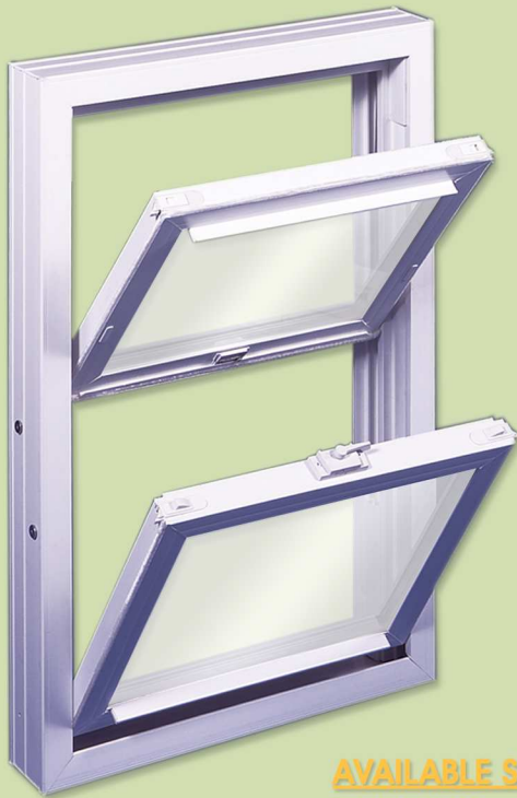
AVAILABLE STYLE: DOUBLE HUNG