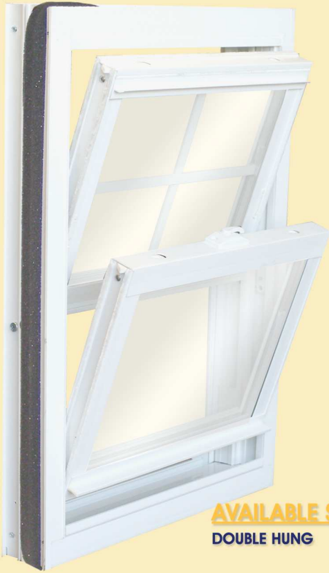
AVAILABLE STYLE: DOUBLE HUNG