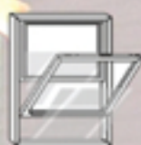
CVD-200 Double Hung

The VERSATILE Crystal Series 200 Fully Welded Vinyl Line is also available in a full collection of styles, sharing many similar features.