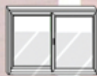
CVS-220 2 Lite or 3 Lite Slider