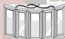
Bays & Bows